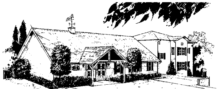
"The Barn" built in the 1930's to house Welsh ponies, serves as Mid-South's offices.