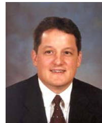
Bruce Westerman, P.E., R.F., S.R. Engineer and Forester