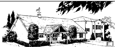
"The Barn" built in the 1930's to house Welsh ponies, serves as Mid-South's offices.